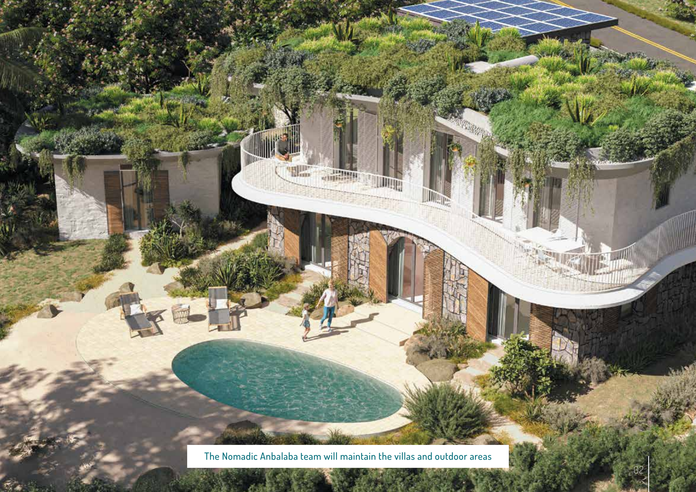
The Nomadic Anbalaba team will maintain the villas and outdoor areas