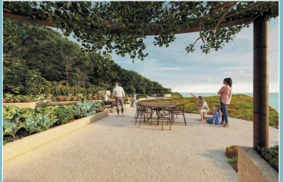
Breathtaking views of the southern lagoon and Indian Ocean from the restaurant