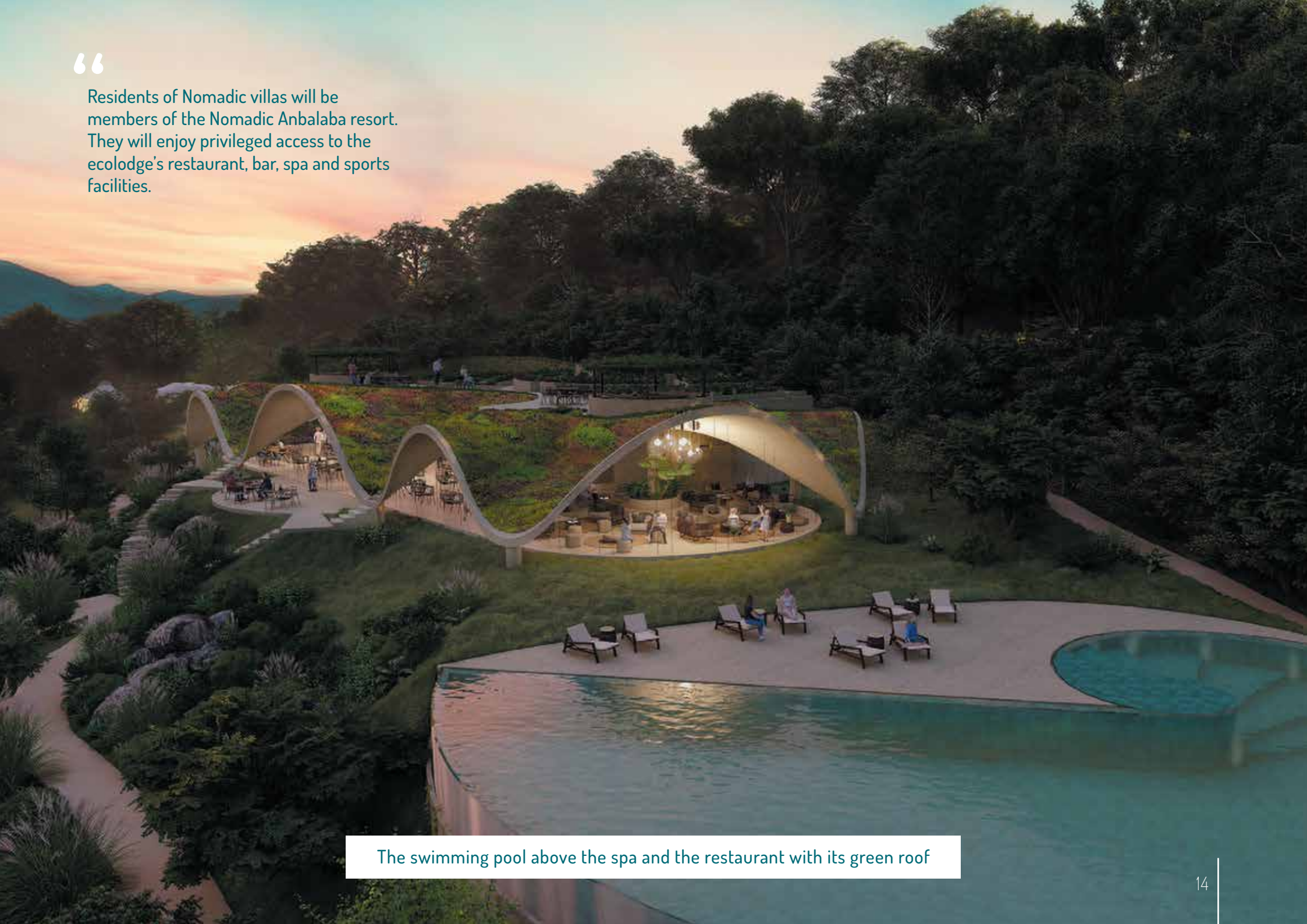
The swimming pool above the spa and the restaurant with its green roof

Residents of Nomadic villas will be members of the Nomadic Anbalaba resort. They will enjoy privileged access to the ecolodge's restaurant, bar, spa and sports facilities.