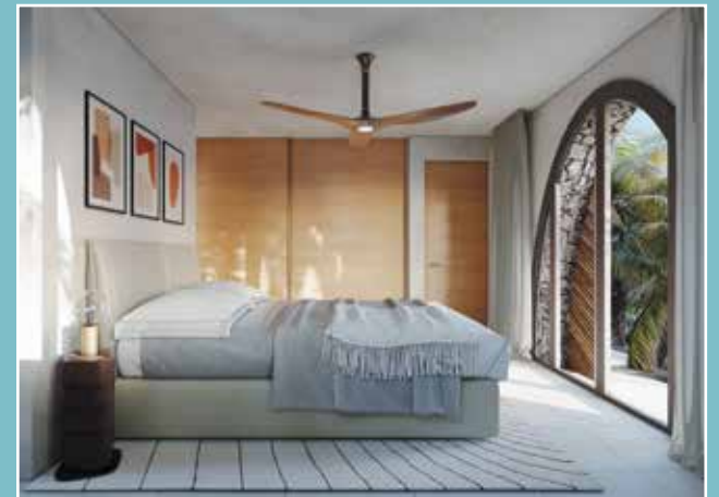
Interior of a Rivulet furnished and decorated by Roche Bobois