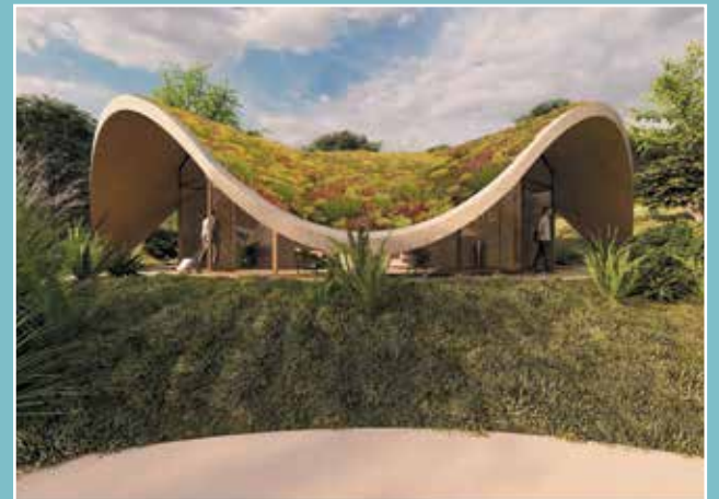
Our eco-committed resort is completely integrated into nature with its comfortable tents and restaurant with a permaculture vegetable garden on the roof for a unique and respectful travel experience